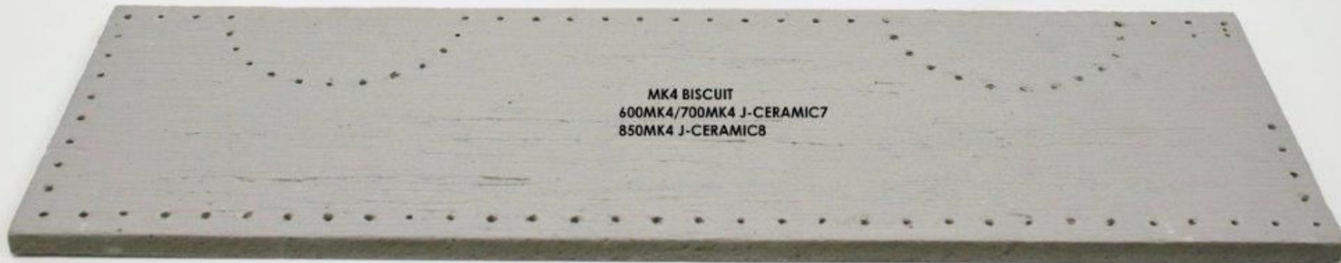
MK4 BISCUIT 600MK4/700MK4 J-CERAMIC7 850MK4 J-CERAMIC8