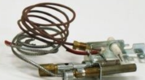
PILOT LP GAS J-8422