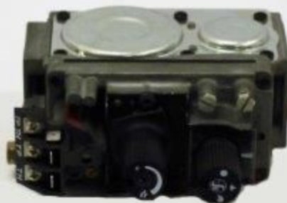
GAS VALVE NAT GAS J-820332 LP GAS J-820331