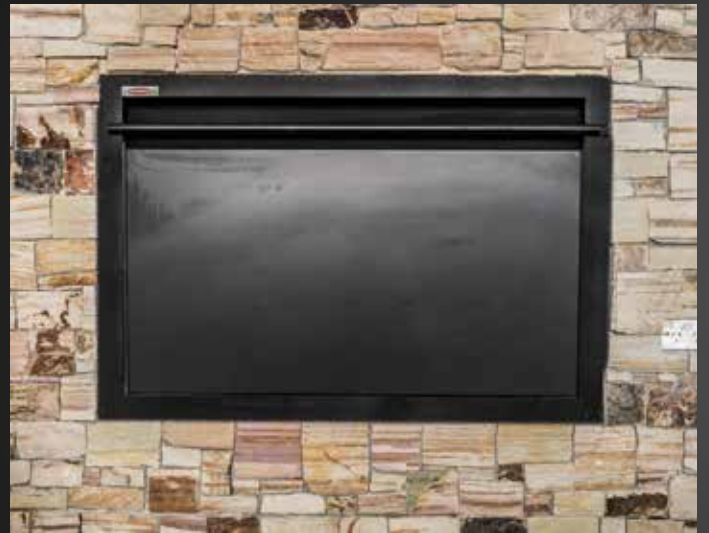
Pictured: Jetmaster built in BBQ & outdoor fire with closed door