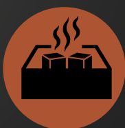
CHARCOAL STARTER TRAY