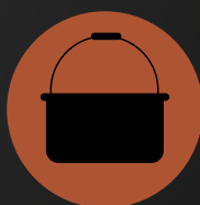
CAST IRON STEWING POT HOOK