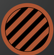
NICKEL PLATED GRILL